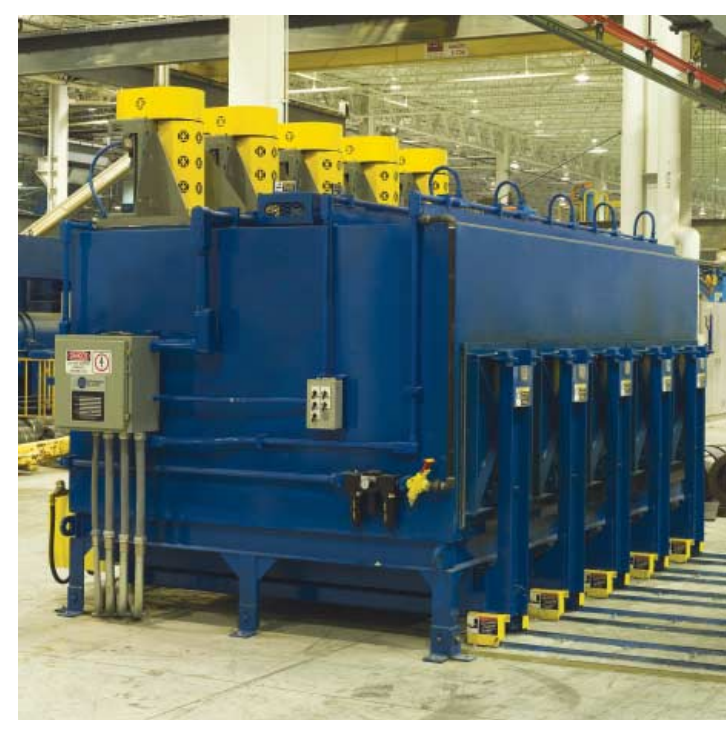
The Granco Clark multi-compartment die oven features individually heated drawers, minimizing heat loss and providing convenient die handling.

The Granco Clark rotary die oven consists of a rotating turntable with individual die cradles. The turntable rotates to move selected dies under the door opening for charging and discharging. This means minimal cold infiltration at the door opening, thus more uniformly heated dies and improved energy efficiency. The rotary oven is particularly well-suited to automatic die storage/retrieval systems, due to its single-point loading and unloading.