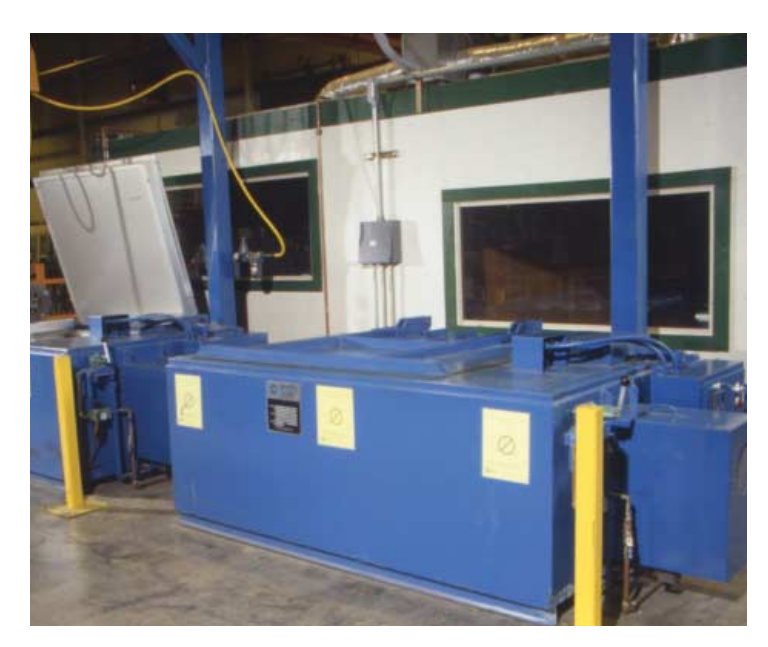
The Granco Clark chest-type die oven is a rugged and economical option for die heating.